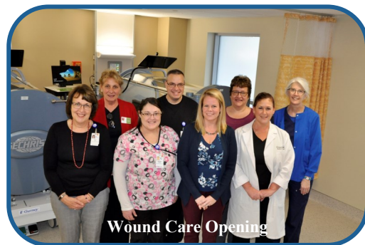
Wound Care Opening

Quick Care Expansion: After the closing of Oneida Medical Associates (OMA) in Camden, we opened a second Quick Care location in OMA's previous office near Tops. Quick Care provides a convenient solution to receiving non-emergency care, with no appointments needed. With a location already established in