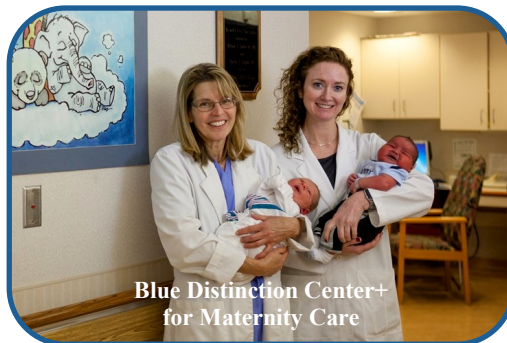
Blue Distinction Center+ for Maternity Care

Center+ for Maternity Care. Blue Distinction Centers are nationally designated hospitals that show expertise in delivering improved patient safety and better health outcomes, based on objective quality measures developed with input from the medical community.