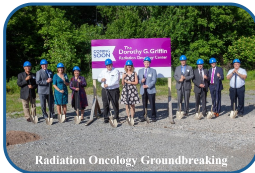
Radiation Oncology Groundbreaking

Labor and Delivery: In February, Excellus BlueCross BlueShield recognized our Labor and Delivery as a Blue Distinction