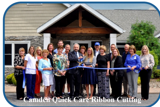
Camden Quick Care Ribbon Cutting

Oneida, Quick Care is the perfect substitute for patients who are unable to see their primary care provider.